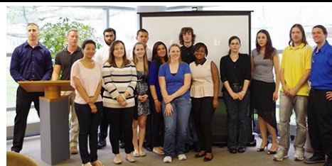
Graduating Seniors at the Awards Ceremony