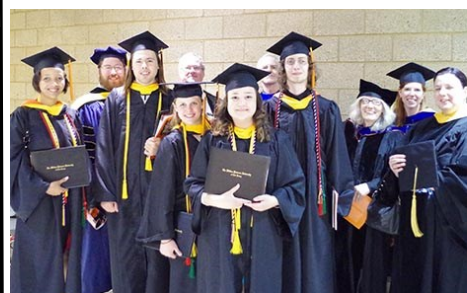
Biology graduates and faculty after the ceremony